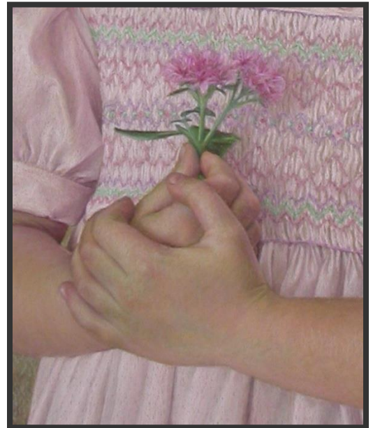
Virginia (detail), pastel by Brenda Hash

Days Two and Three: Work in either oils, pastels, or charcoal. Bring any simple items you might want to add to your still life setup. Cast hands will be provided and are shown below (most measure 10" tall).